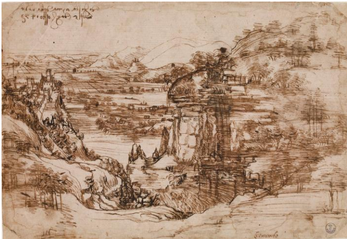
Florence, Gabinetto Disegni e Stampe degli Uffizi, Drawing 8P