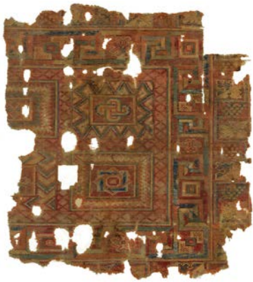
Carpet Fragment, 4th-5th century, Egypt, Antinopolis, New York, Metropolitan Museum, Inv. No. 3 1 2.1