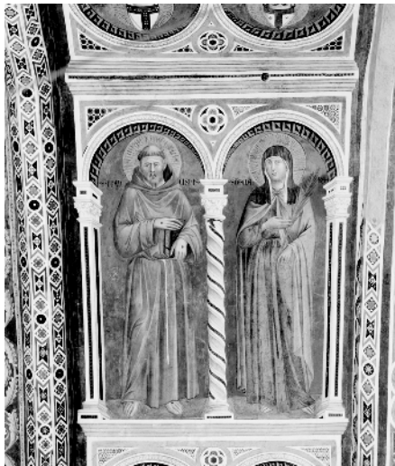
Saint Francis and Saint Clara, front bay of San Francesco in Assisi

The exhibition presents the resulting photographs of the frescoes in the Upper Church of San Francesco in their former entirety. They document the Evangelists' vault by Cimabue and his school, parts of which fell to their destruction during the earthquake, in addition to the vault of the Church Fathers and the pair of Saints on the front bay vault, attributed to Giotto and his school and completely destroyed in the quake.