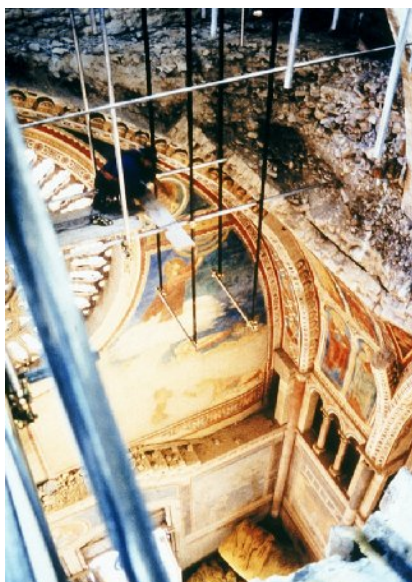
The arch of the front bay of S. San Francesco in Assisi, photographed by Ghigo Roli, 1997 © Photo archive of the Sacro Convento della Basilica di San Francesco in Assisi

The most violent tremor hit Assisi in the early hours of the morning of 26 th September 1997 after Umbria and the Marche had already suffered several minor seismic shocks. It caused serious damage to the world-famous Basilica di San Francesco in Assisi, located a mere 20 kilometres from the earthquake's epicentre. The photo library at the Kunsthistorisches Institut in Florenz has organised its fourth online exhibition to mark the tenth anniversary of the earthquake which struck Assisi on 26 th September 1997.